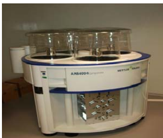
Figure 1. Picture of the AX64004 comparator

The Figure 1 show the layout of AX64004 automated mass comparator for calibration of the weights from 1 kg up to 5 kg with high resolution and repeatability mentioned in Table 1.